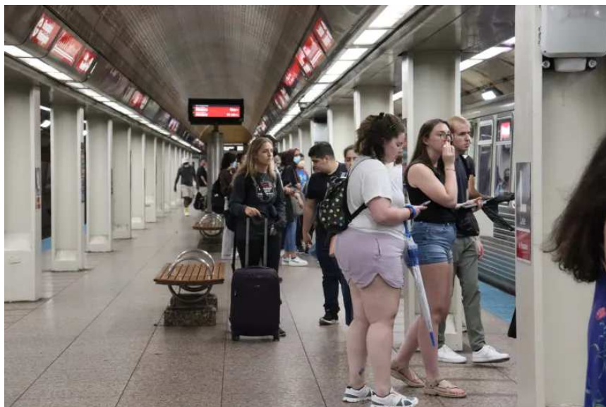
The Red Line Monroe stop is the last stop on Mike McMains' Underground Chicago (Plus Rats!) tour.

Public tours are available 1 p.m. on most Fridays and 10:30 a.m. Saturdays. Private tours can also be booked online.